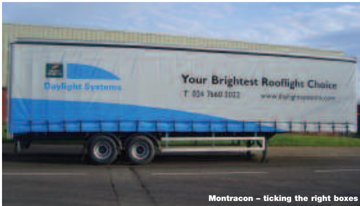
Montracon - ticking the right boxes

The introduction of articulated vehicles to the group's hitherto all rigid in-house fleet in Britain was prompted by steadily increasing product sales coupled with the need to improve distribution efficiency by both reducing reliance on sub contractors and exercising greater control over fleet movements.