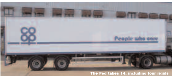
The Fed takes 14, including four rigids

All the vehicles have joined a fleet that now includes 38 tandem axle trailers involved in continuous multi-drop deliveries of chilled and ambient produce from an Ipswich based RDC to stores throughout East Anglia.