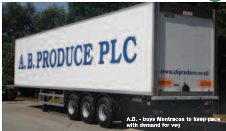
A.B. - buys Montracon to keep pace with demand for veg

Measham based A.B. Produce PLC has acquired three Montracon refrigerated trailers to handle the on-going expansion of its operations to meet increasing demand for its washed potatoes and prepared vegetables from