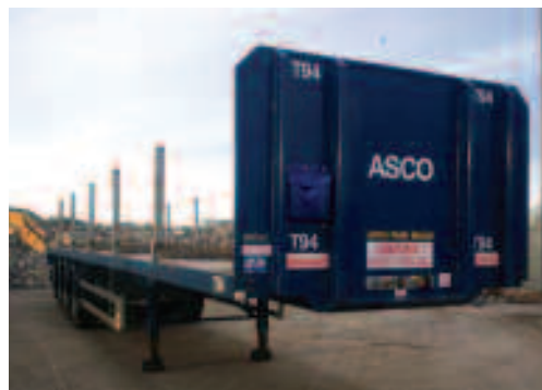
Montracon – heading toward a fleet standard for ASCO

ASCO provides total logistics support for the offshore oil and gas industry within 30 miles of the granite city. And that means the provision of all from machinery, tools and equipment needed to keep the oil and gas flowing through to the food and other supplies needed to sustain the rig crews.