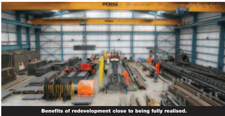
Benefits of redevelopment close to being fully realised.

So it is perhaps a happy coincidence that all should fall into place this year when Montracon celebrates its 30th anniversary in trailer manufacture. Events - involving employees and customers - are planned for the Doncaster plant in September, virtually to the day the first trailer rolled off the line.