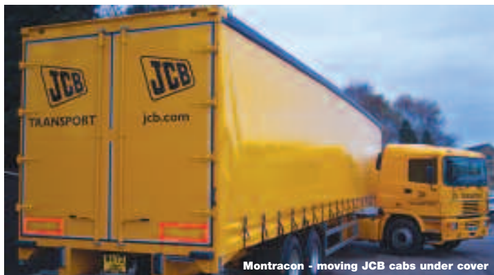
Montracon - moving JCB cabs under cover

All 11 have just entered service moving cabs from the JCB plant at Rugeley for mounting onto machines on the assembly line at the company's main UK plant - in Rugeley, Staffordshire.