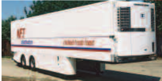
Twenty five tandem fridges to NFT