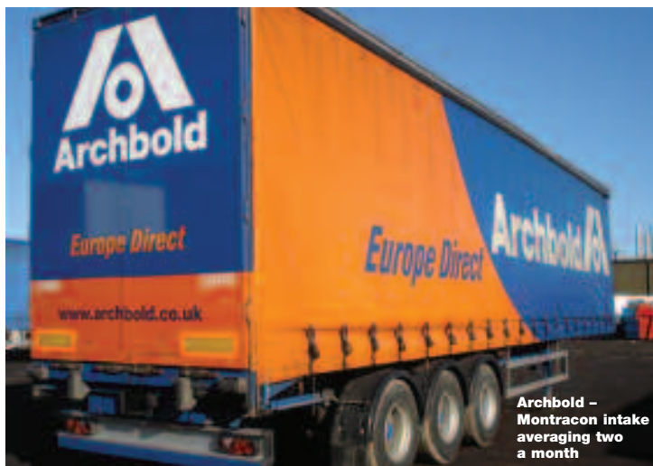
Archbold - Montracon intake averaging two a month