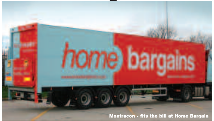
Montracon - fits the bill at Home Bargain