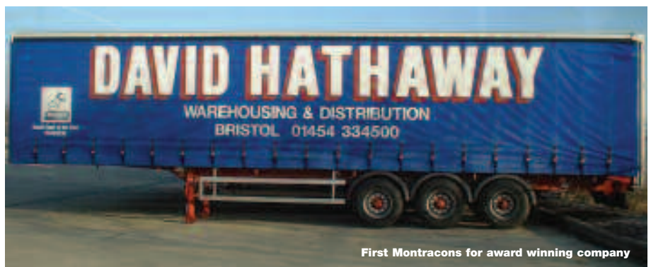
First Montracons for award winning company