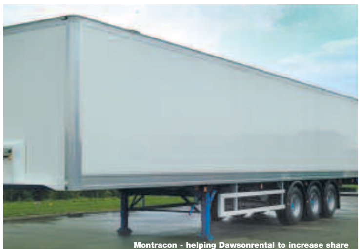
Montracon - helping Dawsonrental to increase share

The trailers in Dawsonrentals care are well maintained - a central repair and maintenance management facility is open 24/7 throughout the year - and most trailers will undergo a thorough refurb at least once in their seven or so years. Nevertheless, Dawsonrentals would agree that its ability to continue to increase share in an ever more competitive market place stands testament, in part at least, to the build quality and durability of Montracon trailers. After all, that's why Dawsonrentals has continued to buy them for the past 20 years.