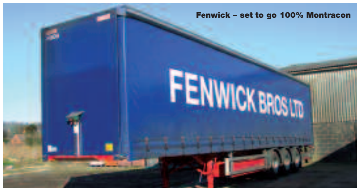
Fenwick – set to go 100% Montracon

For the most part, the Beelsby (Grimsby) based family run haulier moves bagged fertiliser, the latest trailers being around 200mm higher than hitherto to provide the additional head clearance to ease loading/unloading, especially of tonne bags.