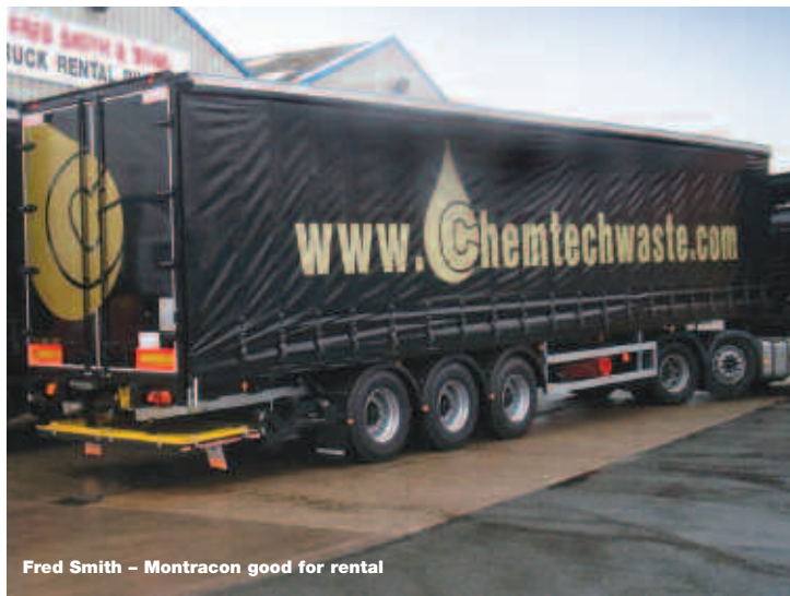
Fred Smith - Montracon good for rental