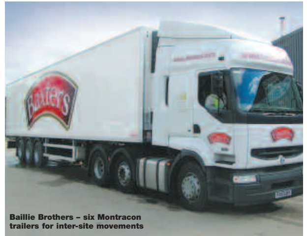
Baillie Brothers - six Montracon trailers for inter-site movements

All six trailers are also covered by a maintenance contract serviced by Baillie Brothers who are currently in discussions that are expected to lead to its appointment as a Montracon service agent.