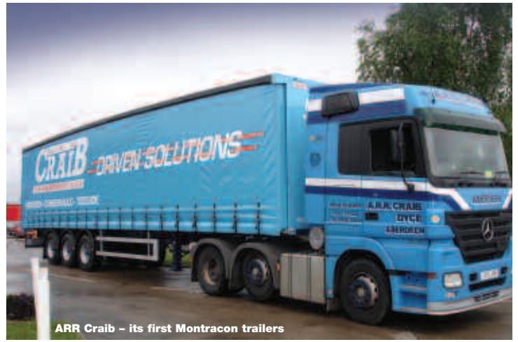
ARR Craib - its first Montracon trailers