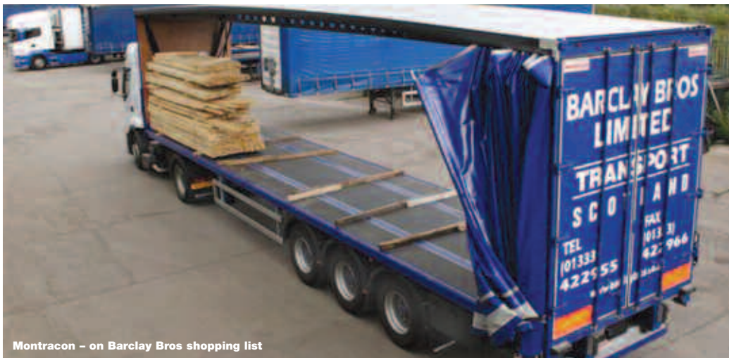
Montracon - on Barclay Bros shopping list

Methill, Fife, based haulier Barclay Bros has taken delivery of its first Montracon trailer, a pillarless curtainsider for in service evaluation against other major marques in the company's mixed trailer fleet.