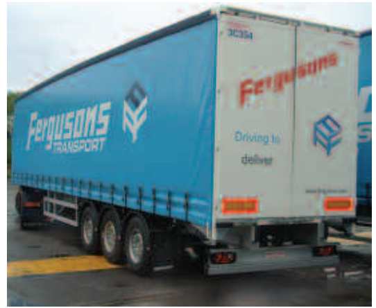
Fergusons – another 10 Montracon trailers

All 10 trailers are in the process of delivery, joining Fergusons' already 320 strong trailer fleet operating out of four UK depots on general haulage duties including in the automotive sector – servicing the Nissan plant in Washington.