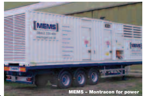
MEMS – Montracon for power

These additional trailers are incremental to cover increasing demand for major power solutions. MEMS is also planning further additions from Montracon to meet forecasted continued growth.