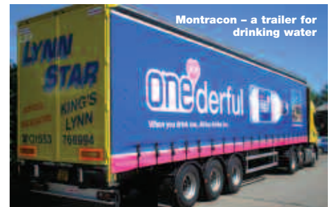
Montracon - a trailer for drinking water

All profits go directly to the not for profit NGO Roundabout International and pay for children's roundabouts that are installed above village boreholes. Water is drawn up into surface tanks by a pump linked to the roundabout and, therefore, powered by the children as they play on it!