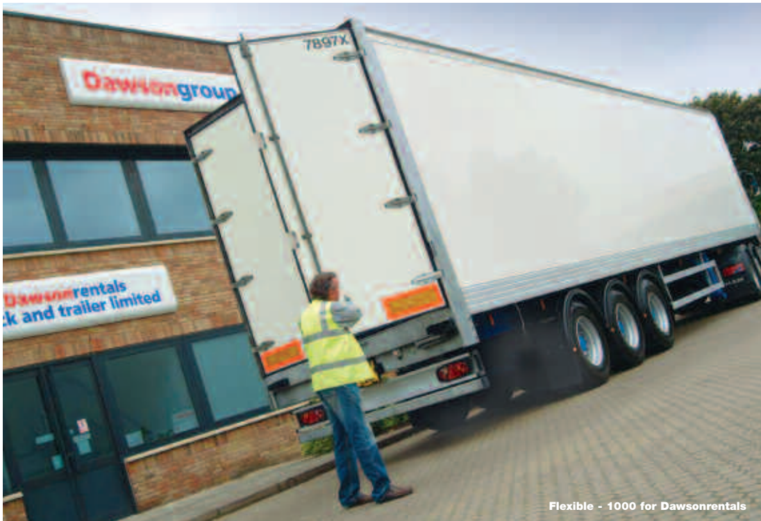
Flexible - 1000 for Dawsonrentals

ery flow line that can be tuned to meet on-going commercial requirements while Montracon can offer greater production flexibility derived from its recent heavy investment in equipment and facilities to alter production mix and volumes based on customer demand.