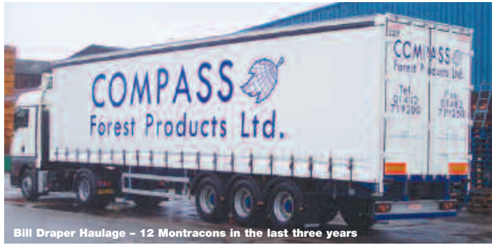
Bill Draper Haulage – 12 Montracons in the last three years

Today the company runs a fleet of 36 trailers, most of them curtainsiders, the recent additions being acquired to handle business growth.