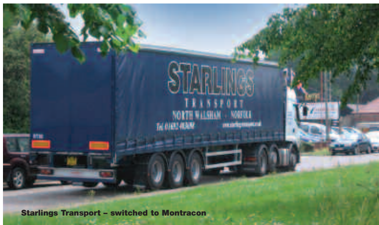
Starlings Transport – switched to Montracon