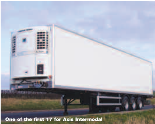
One of the first 17 for Axis Intermodal

'Our engineer's report on the overall quality and suitability of the Montracon trailer coupled with a competitive price and immediate availability was enough to clinch the deal in Montracon's favour. Barring unforeseen problems, we will certainly be including Montracon in our future purchasing plans.'