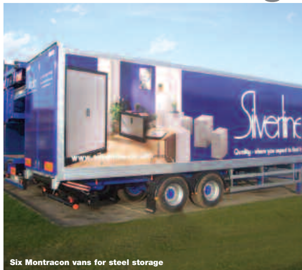
Six Montracon vans for steel storage

All six have joined the Silverline fleet moving equipment from Mildenhall to office equipment distributors and wholesalers, nationwide.