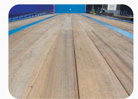
29mm Keruing hardwood floor as standard, with other floor types available.

Montracon offers a choice of lighting packages, including the LED that is increasingly becoming the preferred choice for improved performance and longevity.