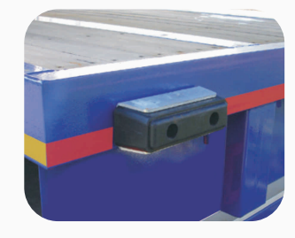
Generously dimensioned buffers help to reduce damage on reversing up to loading docks, for example.