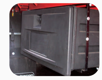
Underslung tool/ equipment stowage boxes available as an option.