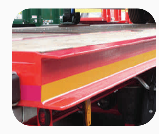
Channel section side rave is offered as an alternative to the standard heavy duty rave.