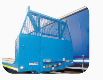
Special design headboards available to suit customer requirements.

Whatever your trailer requirement may be and wherever in Britain and Ireland you are, you will be close to one of Montracon's regional sales executives who will be happy to visit and to discuss how Montracon can best meet your needs.