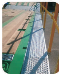
Gripped walkways allow the driver to maintain safe access along the deck even when the load takes up the full width of the trailer bed.