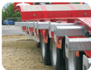
Outriggers extending deck by max 600mm

As one would expect from a company with over 30 years experience in trailer manufacture, Montracon machinery carriers are offered with a wide range of options designed to match an equally wide range of operating requirements.