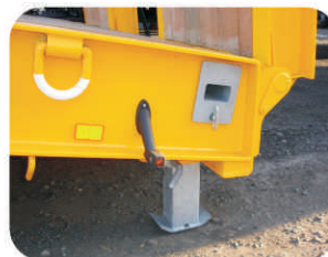
Retractable Rear Steady Legs