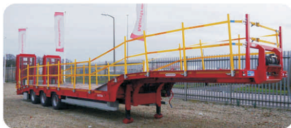
Pull out Hi-Vis handrails and driver fall arrest protection.

Whether its secure movement along the deck or sensors and other safety equipment to alert drivers of cyclists Montracon has listened to its customers and has acted.