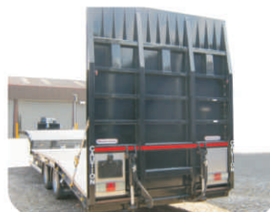
Full Width Ramps