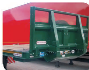
Various headboard configurations available including ENXL Rating