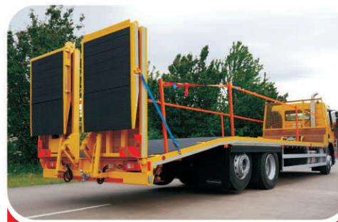
26 Tonne Volvo