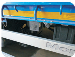
Back Chat and Sensor