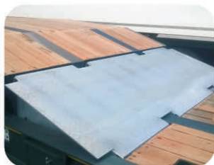
Neck Air Ramp