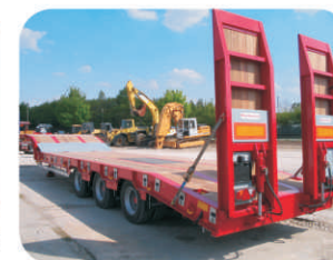
Hydraulic Rear Ramps