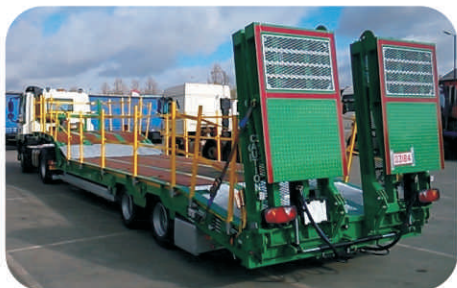
Tandem axle step-frame machinery carriers can be more manoeuvrable than rigid beavertail trucks when it comes to small local plant deliveries.