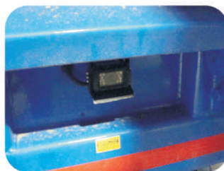
Reversing Camera with In Cab Display