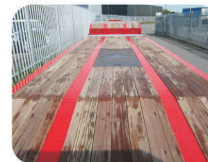
Hardwood Timber Floor