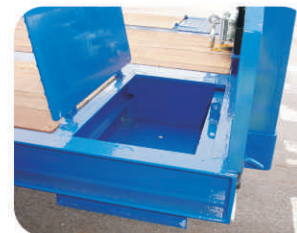
Deck Mounted Tool Box