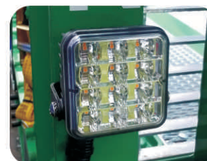
Strobe LED Lighting Options