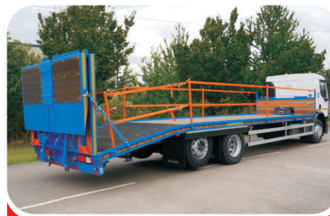
26 tonne Renault

In addition to it's extensive range of machinery carrier trailers, Montracon also produces a range of rigid bodies from 7.5 tonnes gross weight upto 32 tonnes