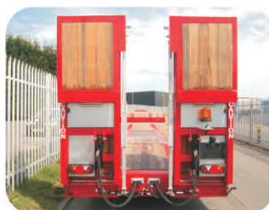
Double Flip Side Shift Ramps