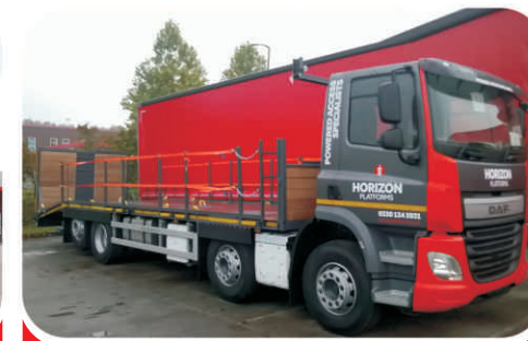
32 Tonne DAF

Whatever your trailer requirement may be and wherever in Britain and Ireland you are, we will be happy to visit and to discuss how Montracon can best meet your needs.