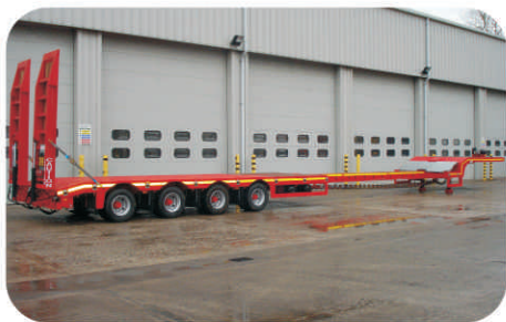
The four axle centre spine extendable machinery carrier with rear steer axle(s).