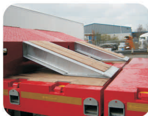
Neck Clip-On Ramps