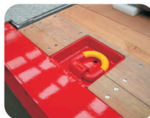
Hinged Lashing Rings